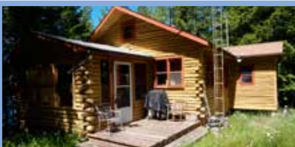
FORTESCUE LAKE $269,000