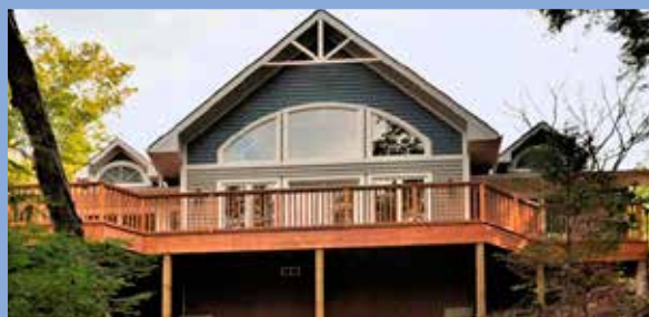
DRAG LAKE $669,000