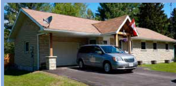
MINDEN LAKE $489,000