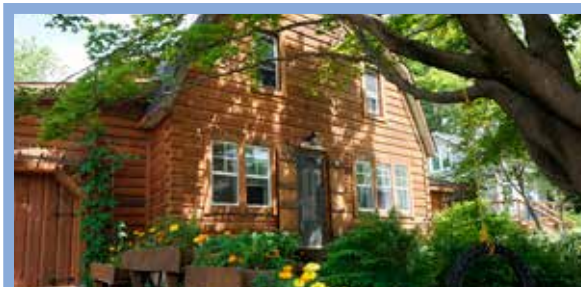
ST. GERMAINE ST. MINDEN $214,900