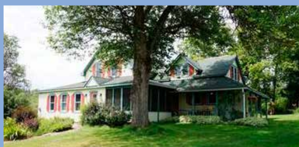
BOSHKUNG LK RD $359,000