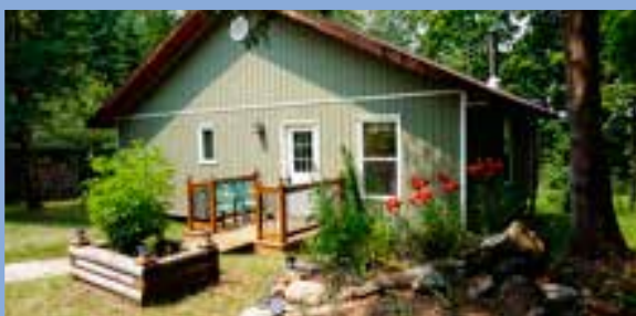
1287 CONTAU LAKE ROAD $125,000