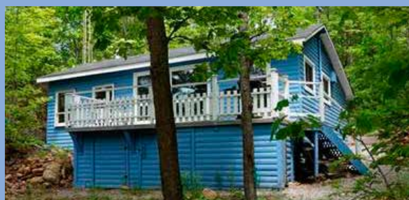
CRYSTAL LAKE $299,900