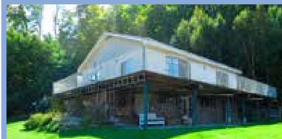
SALERNO LAKE $289,000