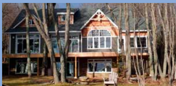
CRYSTAL LAKE $985,000

5 Consecutive Years of Gold & Platinum Awards