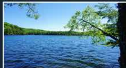
Miskwabi Lake — 2 plus acre lot with 285 ft of clean sand and rock shoreline, Driveway is in and hydro available. Private! $339,000