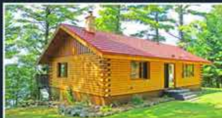
Mountain Lake — Charming log home with west exp. to enjoy stunning sunsets and incredible views. Lots of privacy. $449,900