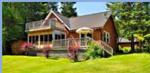
PRIVATE RETREAT 258 ACRES $525,000