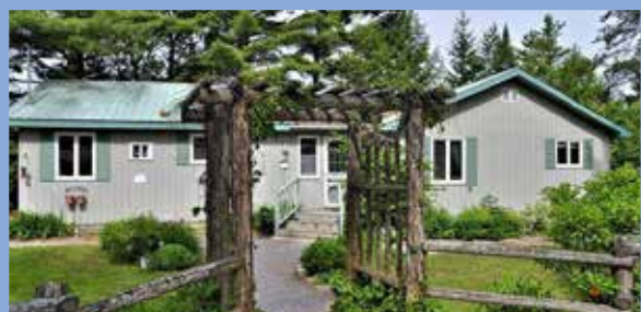
BURNT RIVER - KINMOUNT $275,000