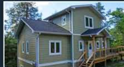
Little Kennisis Lake — New 4 season cottage w/tasteful high end finishes, South Exp, gorgeous views. Comes turn-key! $649,000