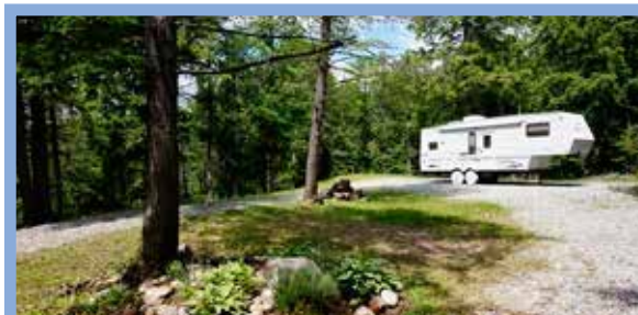
256 ACRES NEAR KINMOUNT $299,000