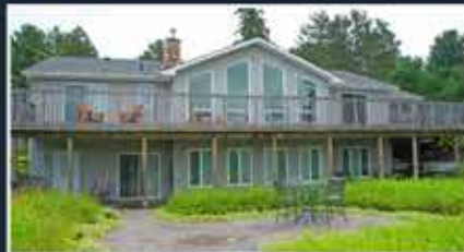
Boshkung Lake — Prime, level, sunset lot, 215 feet of frontage with a beautiful, hard-packed sand beach. Bunkie w/deck. $1,299,000