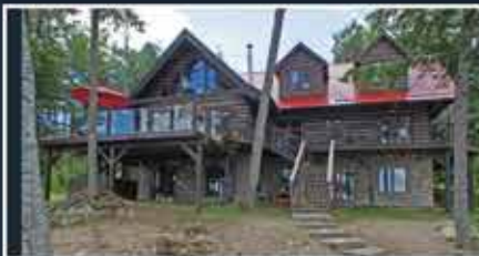
Kennisis Lake — Extremely well appointed executive log home. 2 acres with 275 feet of water frontage. A must see! $1,450,000

We are the #1 team in Haliburton County waterfront sales for the 3rd consecutive year!**