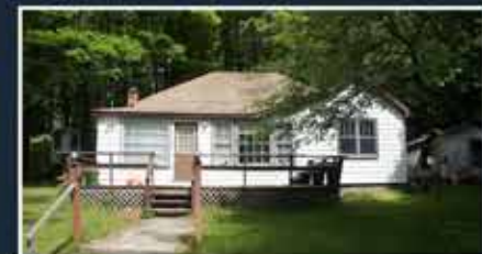
Haliburton — Perfect starter home, close to all amenities w/ great income potential. 2 bedrooms, 1 bath, quiet wooded lot. $125,000

The Chestnut Park Haliburton Team currently has over 60 properties for sale. Visit haliburton-real-estate.com for more info on all of our listings