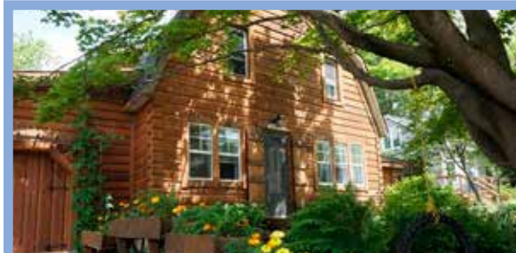
ST. GERMAINE ST. MINDEN $214,900