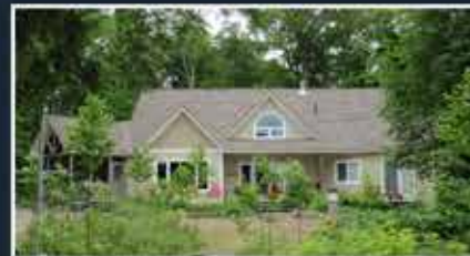
Kennisis Lake — Perfect cottage on the perfect property with sand beach, deep water, level lot, 4 bedrooms, 2 baths. $1,199,000