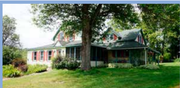
1041 BOSHKUNG LK RD $359,000