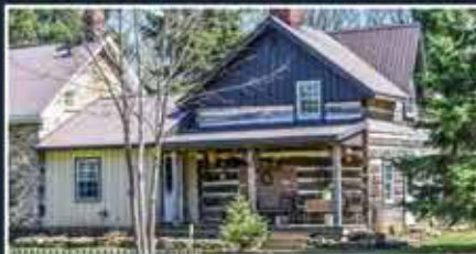
Haliburton — Situated on just over 200 acres, very private. Guest suite and 4800 sqft shop built to commercial standards. $799,000