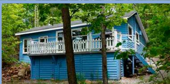
CRYSTAL LAKE $299,900