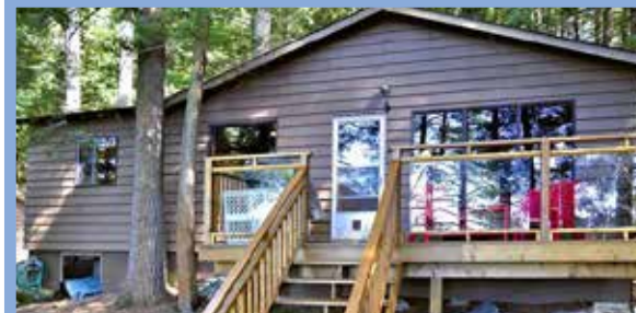
BOSHKUNG LAKE $399,900