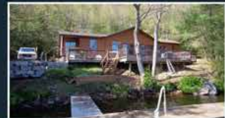
Little Kennisis Lake — Very well maintained home. 3 bedrooms, 4 piece bath, Master w/Jacuzzi tub. Beautiful lake views. $549,000