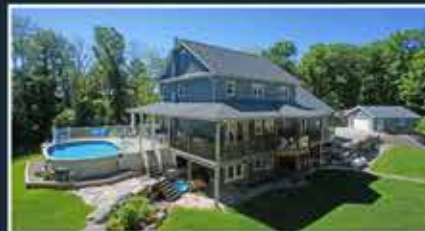
Minden — Executive 4 bedroom, 3.5 bath, totally private, estate home. Heated swimming pool. Heated 2 car garage. $749,000