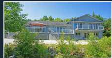
Little Redstone Lake — Finished to the highest of standards, 4 bedrooms, 4 bathrooms, open concept. Heated garage. $997,000