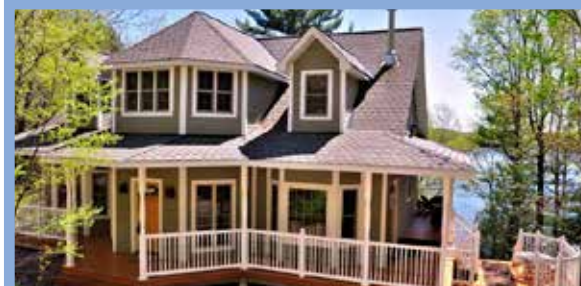
STORMY LAKE $795,000