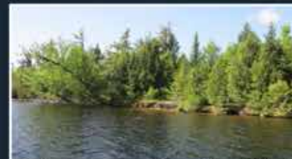
Little Redstone Lake — You'll find peace and tranquility on Hemlock Island, 523 Feet of frontage, 2.25 acres. Multi exposures. $127,900