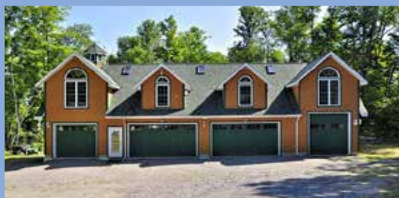
WHITE LAKE 780' $925,000