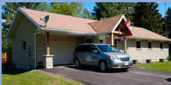
MINDEN LAKE $489,000