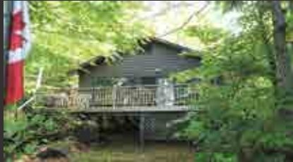
Kennisis Lake - 3 bedroom + 1 bath cottage situated on a perfectly level lot with sand beach, west exp and big lake views. MLS 128035 $649,000