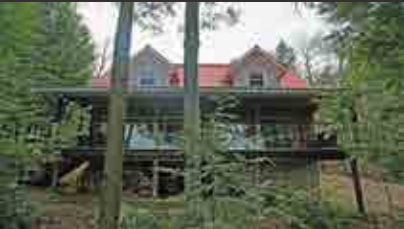
Redstone Lake - Chalet Style 3 bdrms, 2 bath cottage on private Cdn Shield lot with spectacular long lake views. MLS 392850317 $799,000