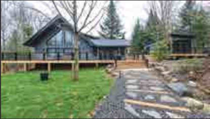
Drag Lake - Dream Cottage has 4 bdrms + 3 Baths, private lot w/south west exp. Bunkie, Hot tub, Sauna. Turn Key! MLS 116380 $1,450,000