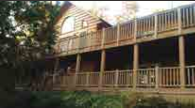
Esson Lake - True North square log cottage/home with 5 bedrooms, 3 bathrooms and a great rental history. MLS 111701 $999,000