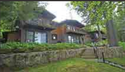
Boshkung Lake - Stunning family cottage/home with 5 bedrooms, 3.5 baths. 1.66 acres + 255.00 ft of ftg. much more! MLS 114953 $1,495,000

THE #1 TEAM IN HALIBURTON WATERFRONT SALES* 6 YEARS IN A ROW!