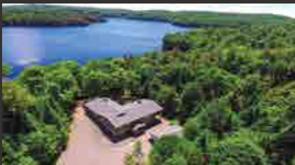
Little Redstone Lake - 4 Season cottage/home with 4 bedrooms + 3 bathrooms, 2.26 acres, south exp, dbl car garage. MLS 121169 $1,099,000