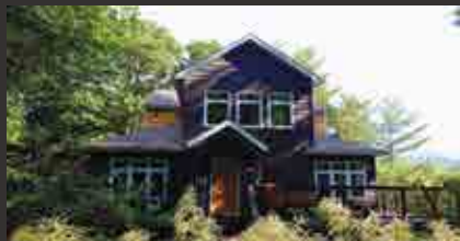
Redstone Lake - 3 bdrm + den, 2 Bath cottage with big lake views & SW exp. 220 ft of shoreline with clean, deep water. MLS 107523 $949,000