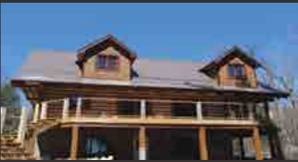
Redstone Lake - Brand new log timber frame cottage with 4 bdrms + 4 Baths, 202 ft of hard packed sand beach & south exp. MLS 114438 $1,350,000