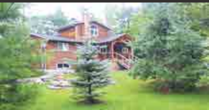
Kennisis Lake - 4 Season Cottage with 3 bedrooms + Den and 2 baths. Dbl car garage w/loft. Flat rock shoreline. MLS 107523 $849,900