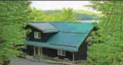
Esson Lake - Year round home on private 4 acre lot, 6 bedrooms + 5 bathrooms. Great rental Property! MLS 112670 $950,000