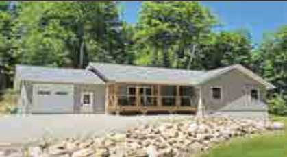
1010 Wenona Lk Rd - Brand new 3 bdrm 2 bath home on prime 36 ac lot with subdivision potential. Min to Haliburton. MLS 136037 $539,000

It is one of your biggest investments. Choose your REALTOR® wisely