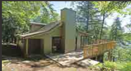
Otter Lake - Completely renovated 3 bedroom 1 bathroom cottage in a picture perfect Algonquin setting. 260 feet of frontage & 1+ acres. $599,000