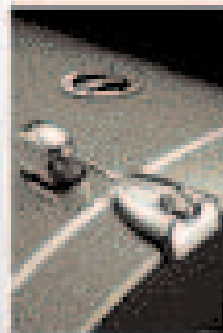
Crush With Bridge Lug