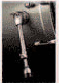
Forged Steel Drum Spew