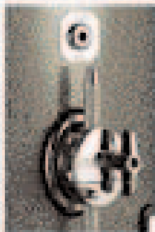
Wing Nut and Lock