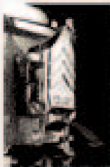
Crush Design Three Off