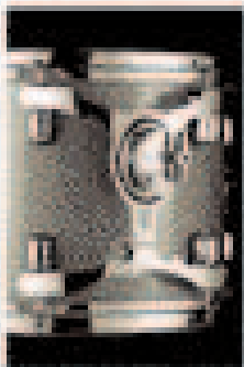
4 Point Suspension Strut

The Sublime Maple Series truly lives up to its name. Featuring 100% North American Maple shells, impeccable lacquer finishes, modern drum hardware design, and attention to detail typically only found in custom drums. The Sublime Series sets a new standard in quality and truly brings the Crush vision of creating classic drum building with modern design to life.