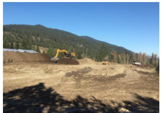
Topsoil stripping along right-of-way at KP 816 near Jamison Creek.

The Indigenous Monitors noted mitigations for the topsoil piles to reduce erosion potential.