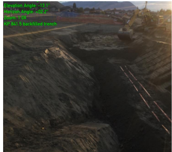
Backfilling trench at KP 841.

The Indigenous Monitors have inspected the excavated soil placed in the trench over the installed pipe. Soil is placed in a mound over the pipe to compensate for soil settlement. The Indigenous Monitors observe the subsoil being backfilled over the pipe prior to topsoil being replaced and ensure backfill activities are confined to the construction right-of-way.