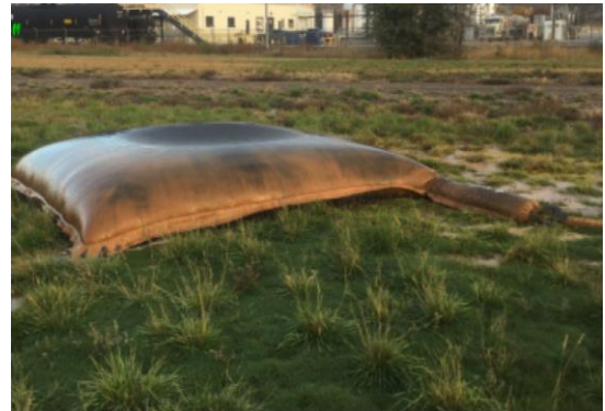
Sediment filtration device at KP 845.

The Indigenous Monitors inspected the pump-off of water near the Kamloops Airport. It was verified that the water management mitigation measures were followed.