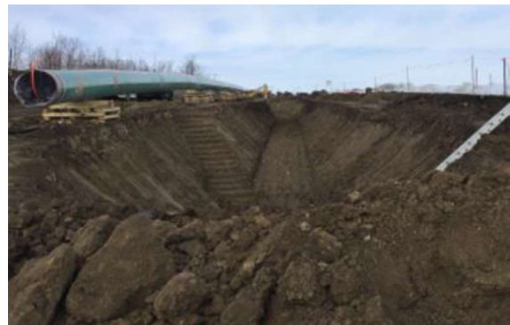
Mainline ditched and prepped for pipe to be lowered in the ground.

The inspection included monitoring the workmanship and safety of the crew on-site, trenching and soil compaction and stability.