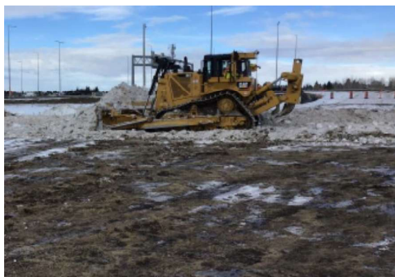
Topsoil and grade stripping on the right-of-way.

The Indigenous Monitors have been involved in monitoring and inspecting such topsoil stripping mitigation. The Indigenous Monitors also walk in transects along the cleared area to investigate any potential chance finds that could be unearthed.