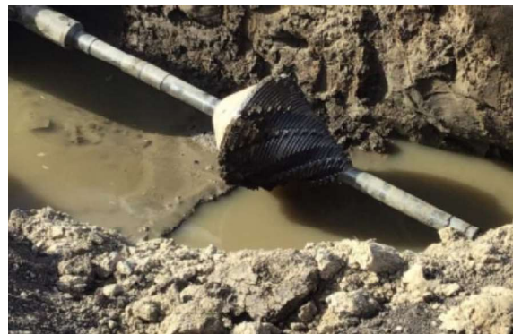
42" reamer on drill bit used to install a section of pipe.

The inspection focused on appropriate signage and flagging, soil stability and ensuring equipment was cleaned and free of vegetation and debris.