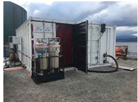
East water treatment plant

The Indigenous Monitor participated in inspection and monitoring activities during the installation of the water treatment plant and will be performing ongoing inspection and monitoring as the water treatment plant is in operation to validate it is performing to required standards.