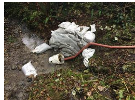
Sandbag dam installed to temporarily divert S6 watercourse

The Indigenous Monitor has been performing monitoring and inspection activities of construction works in and around the watercourse including tree clearing, grubbing and the installation of diversion dams and diversion pumps to ensure no adverse impacts to the watercourse as a result of the activities.