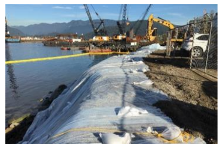
Poly on the foreshore for erosion and sediment control

The inspections involve a number of areas including inspecting environmental mitigations such as poly on the foreshore for erosion and sediment control.