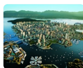
Vancouver, British Columbia