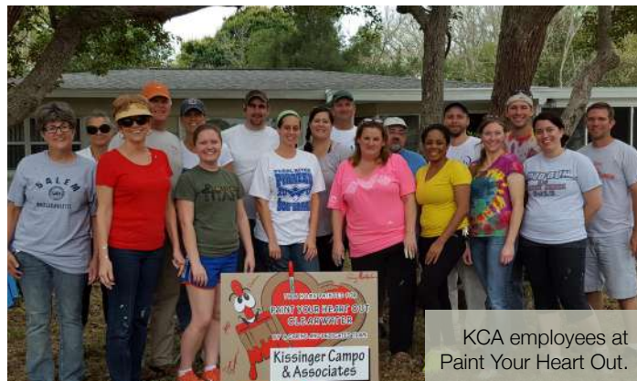
KCA employees at Paint Your Heart Out.

"I can chat with the CEO while getting coffee, or with the