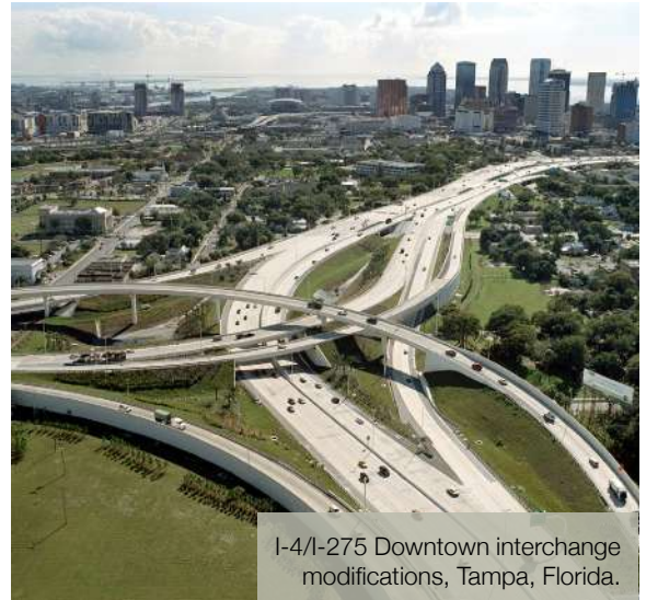
I-4/I-275 Downtown interchange modifications, Tampa, Florida.