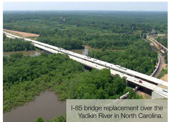
I-85 bridge replacement over the Yadkin River in North Carolina.