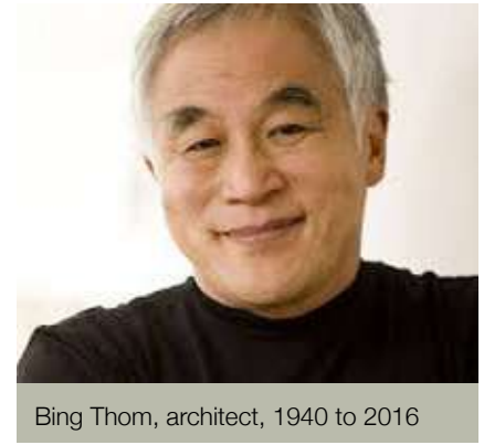
Bing Thom, architect, 1940 to 2016

Thom studied architecture at the University of British Columbia in Canada and received his master of architecture degree from the University of California at Berkeley. He worked in the offices of Fumihiko Maki and Arthur Erickson before opening his own firm in Vancouver in 1982.