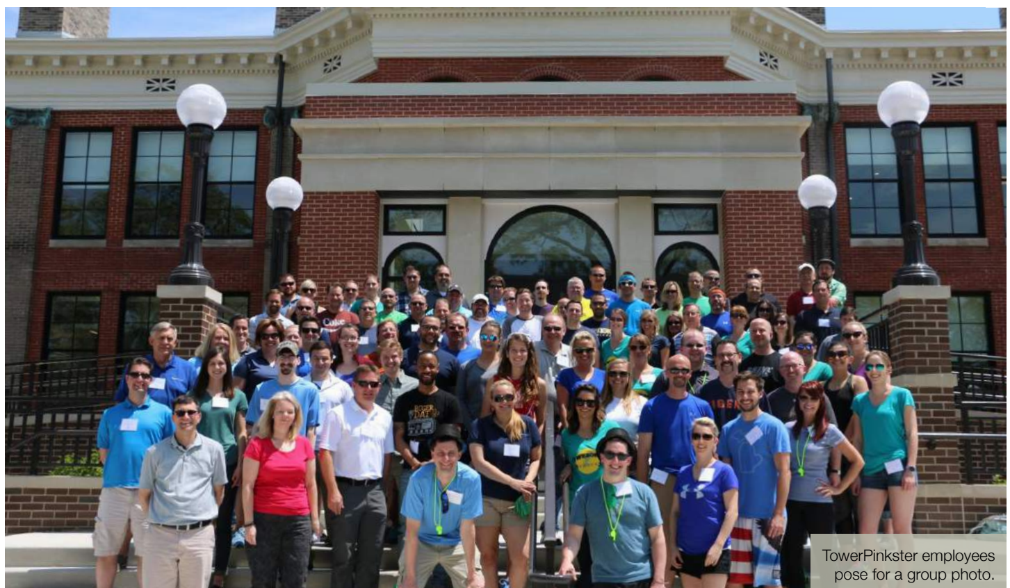
TowerPinkster employees pose for a group photo.

friendly events, such as office trick-or-treating, family picnics, and hockey and baseball game outings.