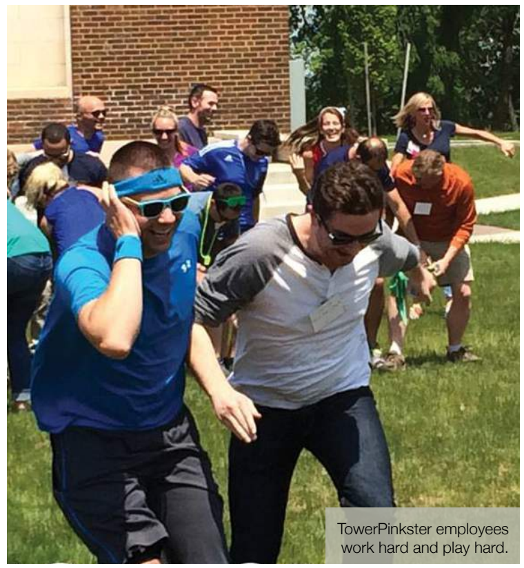
TowerPinkster employees work hard and play hard.