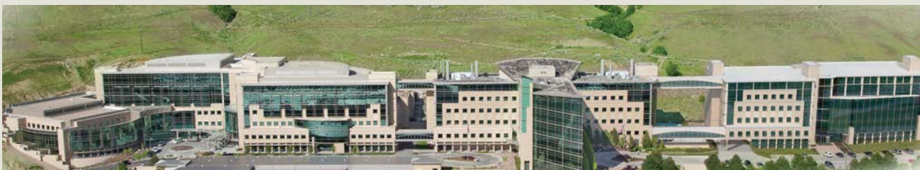
Architectural rendering of The Primary Children’s & Families’ Cancer Research Center (far right) at the Huntsman Cancer Institute