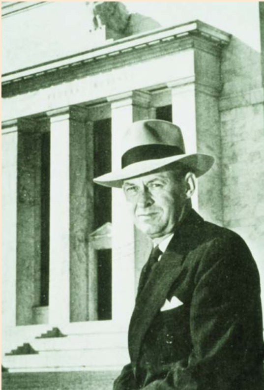
Marriner Eccles, 1951, in front of the Federal Reserve Building named for him, in Washington, D.C.

Born in Logan, Utah, in 1890, Marriner was the oldest of nine children