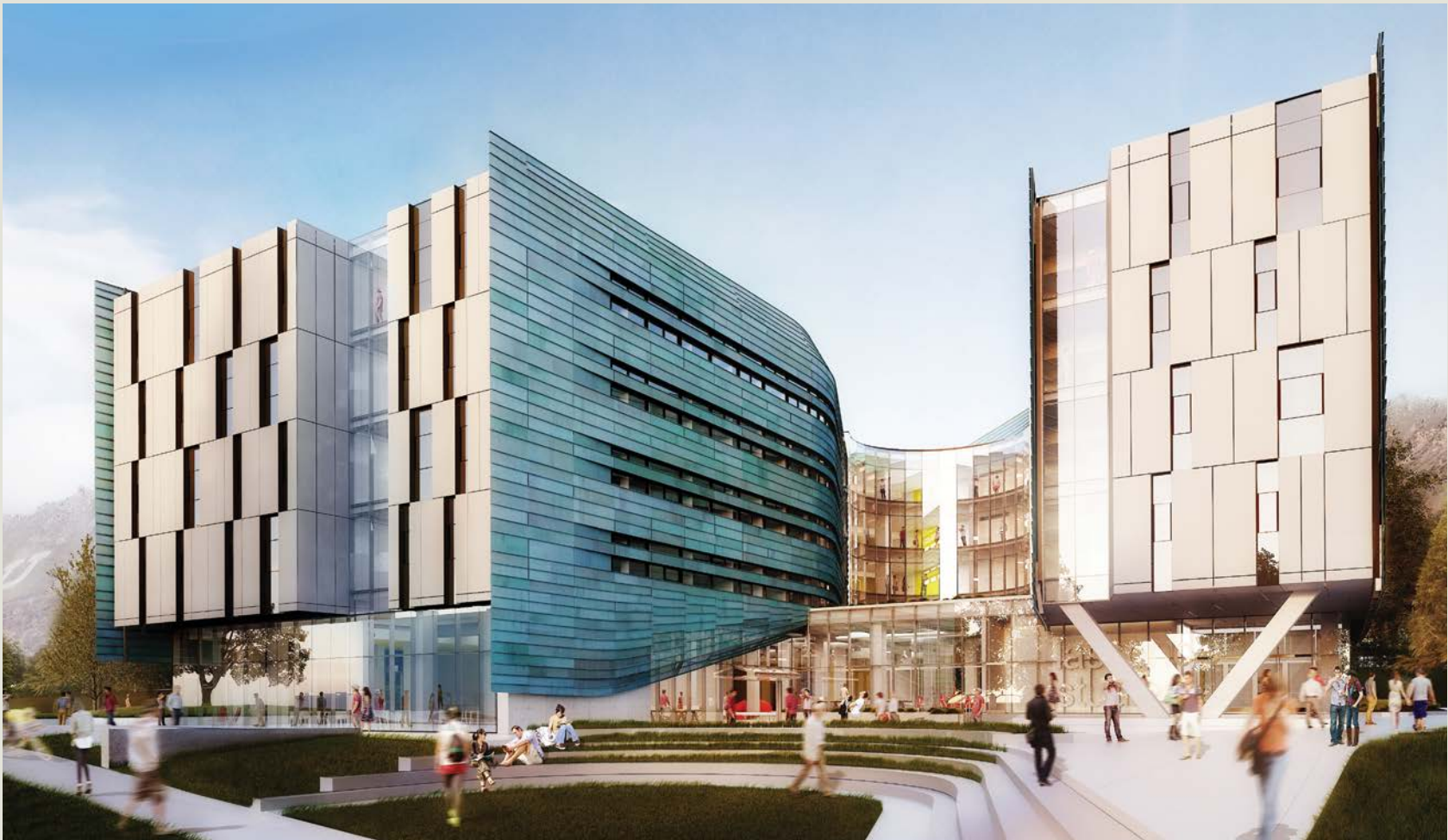
Architectural rendering of the Lassonde Studios, looking northeast