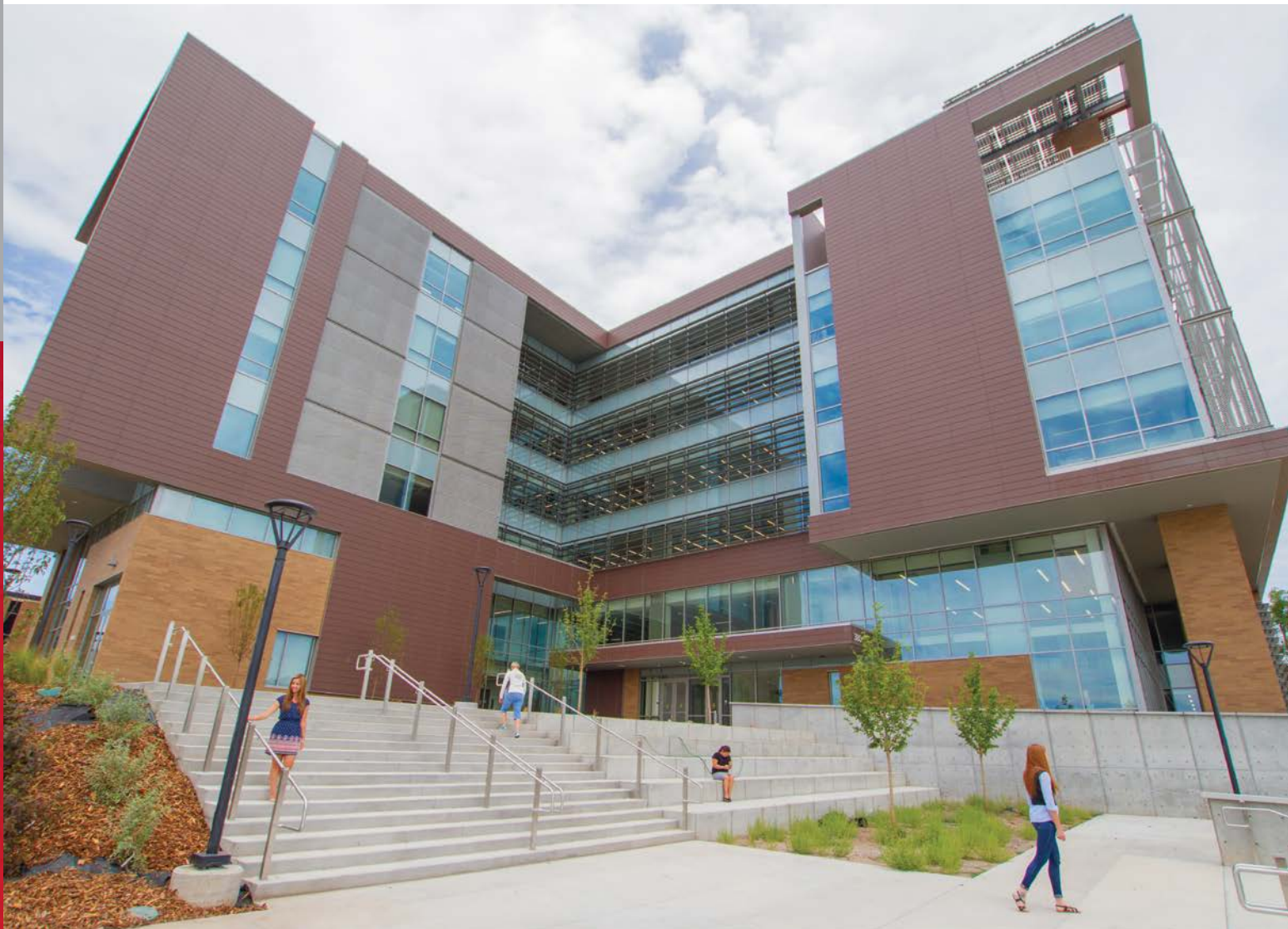
Students use the main entrance to the new law building at the northeast corner of South Campus Drive and University Street.

On September 1, the University of Utah and the S.J. Quinney College of Law celebrated the opening of its new state-of-the-art building, which is intended to foster innovation in legal education, bolster service to the local and global communities, and provide students with enhanced opportunities for skills training.