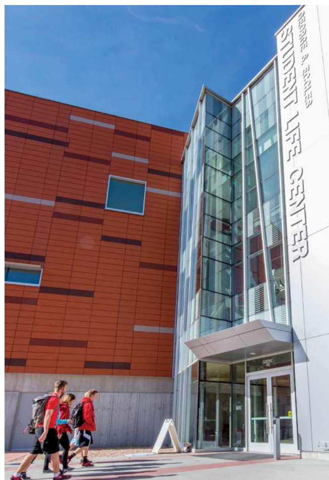
The new Eccles Student Life Center, which opened for use on January 12, is attracting crowds of enthusiastic users.

Additional details may be found online at campusrec.utah.edu .