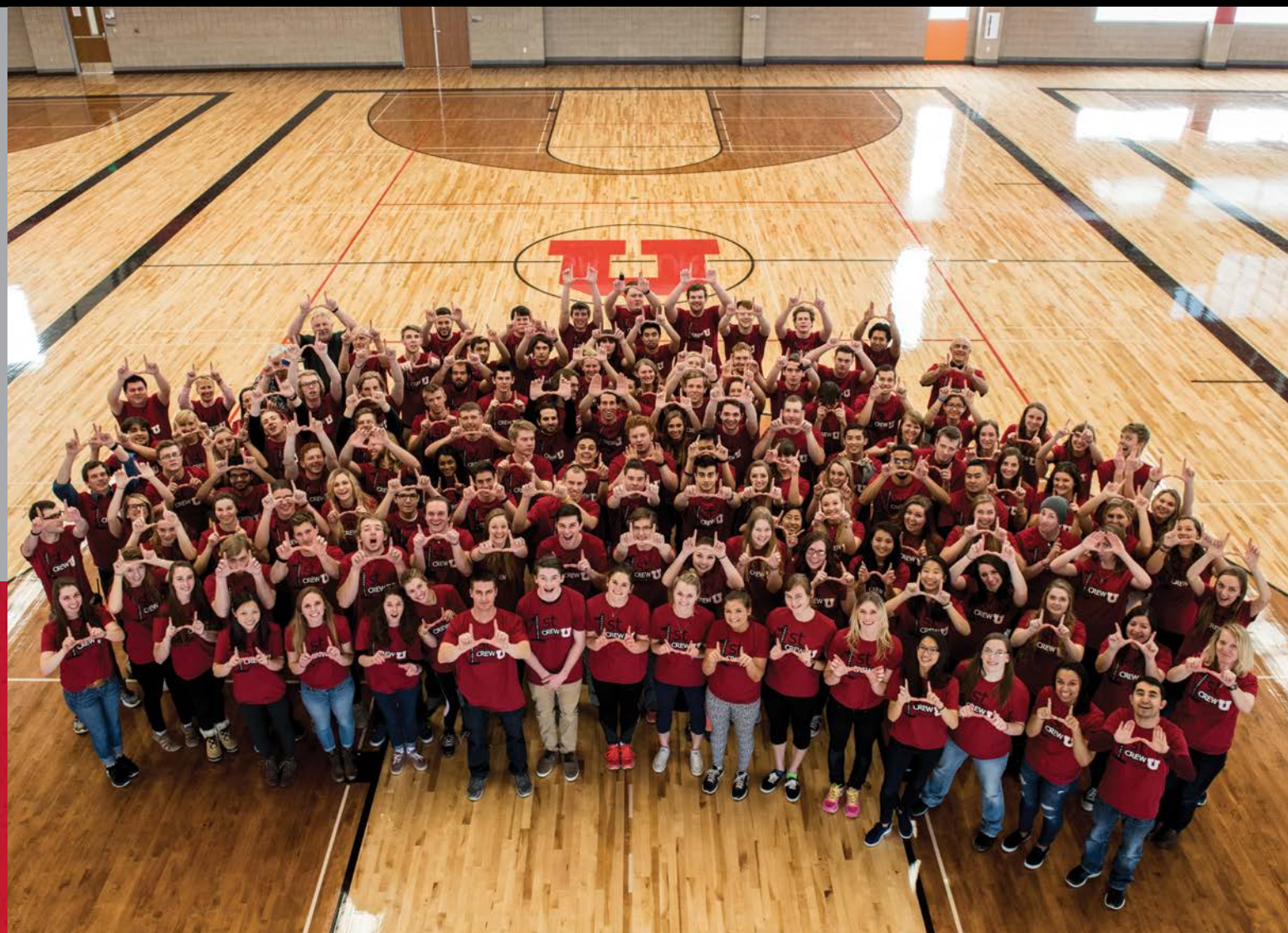
Students gather on the High Courts gym and flash the Imagine U sign in celebration of the opening of the George S. Eccles Student Life Center.