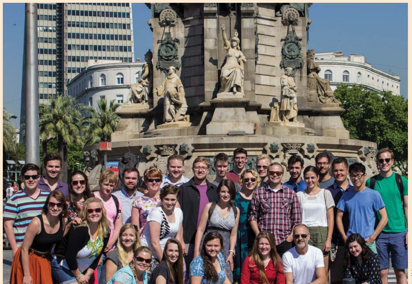
Members of the University Chamber Choir gather in front of the Columbus Monument in Barcelona.