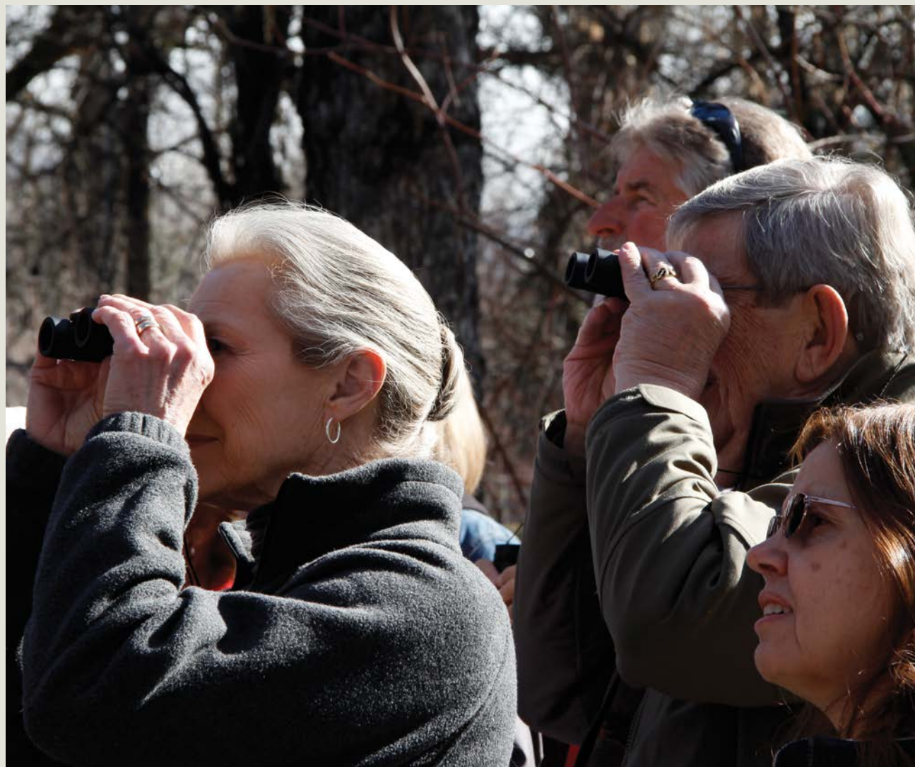
A group of nature enthusiasts enjoys an Osher birding class.