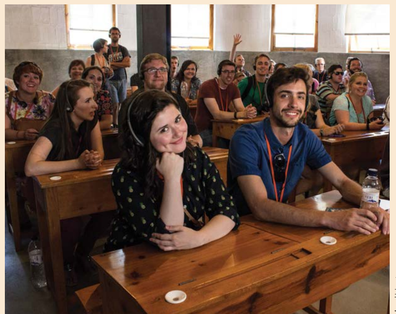
Choir members visit a classroom near the Roman Catholic Church La Sagrada Familia in Barcelona.