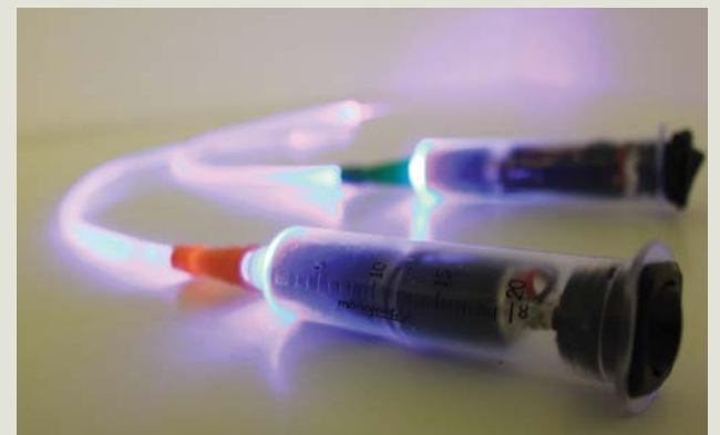
Veritas Medical's bacteria killing LIGHT LINE Catheter™