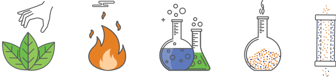
1 Handpicking > 2 Fire-Roasting > 3 Extraction > 4 Concentration > 5 Purification

Proprietary yerba mate extract – The yerba mate in Unimate Fuel is uniquely powerful thanks to a unique five-step patented process. Beginning with handpicking and fire-roasting and followed by the extraction of active biological molecules, concentration, and purification.