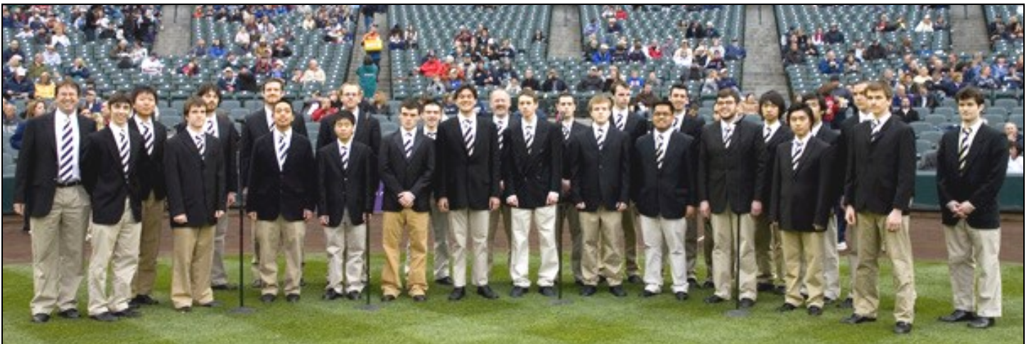
The new glee club, which now boasts 40 members, made its debut at the Nov. 17 Husky football game, where they performed with the band before the game and sang The Star Spangled Banner to open it.