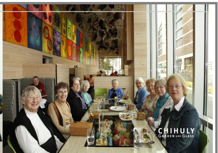
Antiques and Collectibles Luncheon