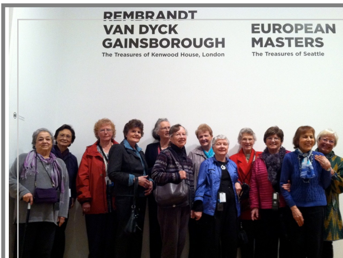
Gallery Goers at SAM