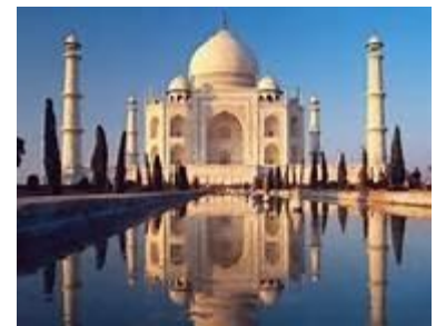
The Taj Mahal in Agra, India