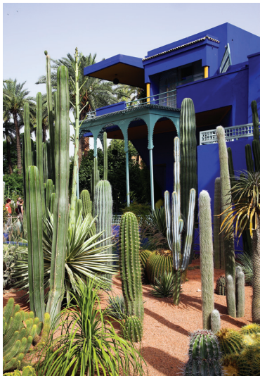
On Day 12, we visit Majorelle Gardens.

Day 9: Erfoud/Tinehir/Todra Gorge/Ouarzazate Our destination today is in the snow-topped High Atlas. The day features one beautiful scene after another, including the village of Tinehir, a stunning mountain oasis rising on a series of riverside terraces