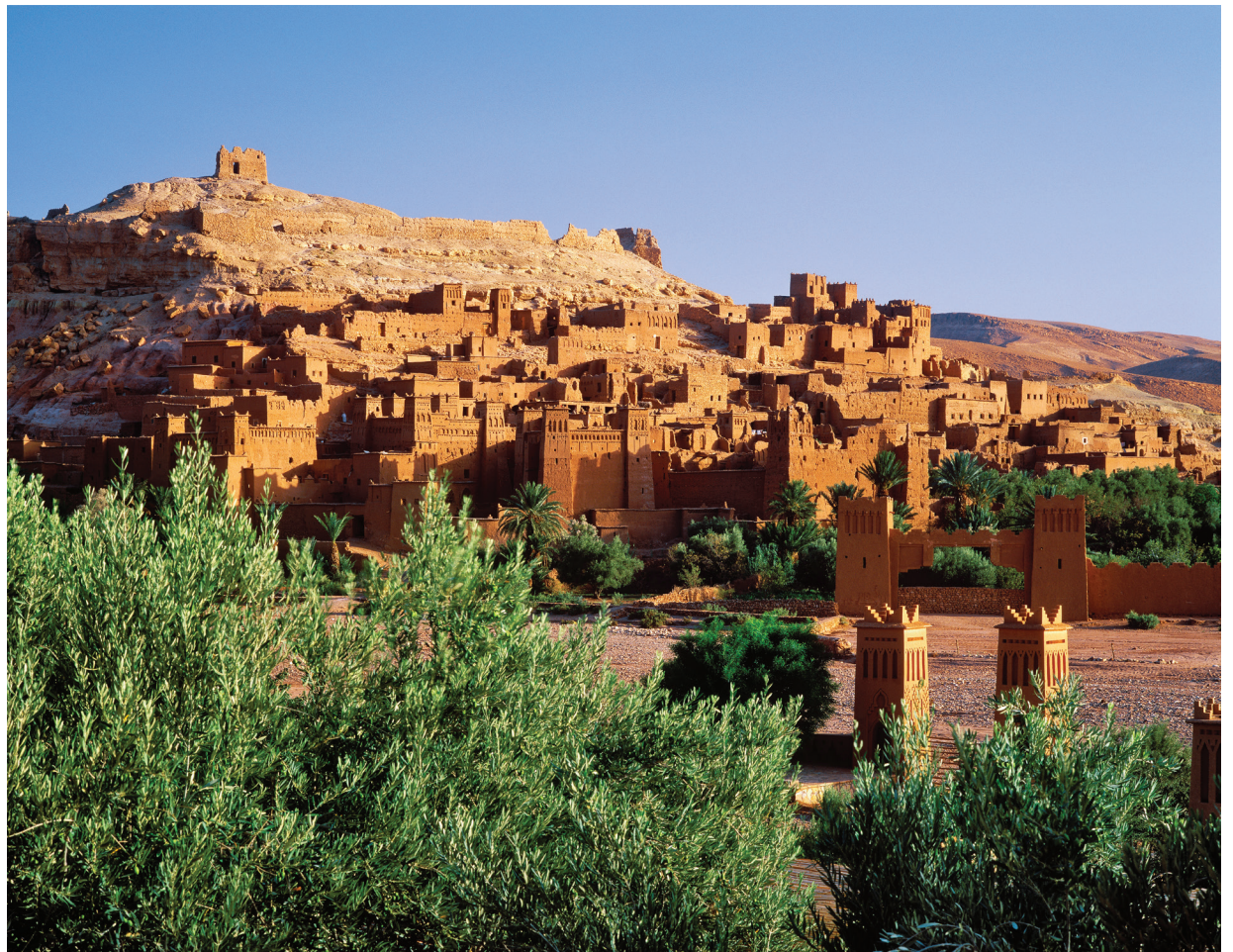
We encounter many of Morocco's age-old kasbahs on our journey.