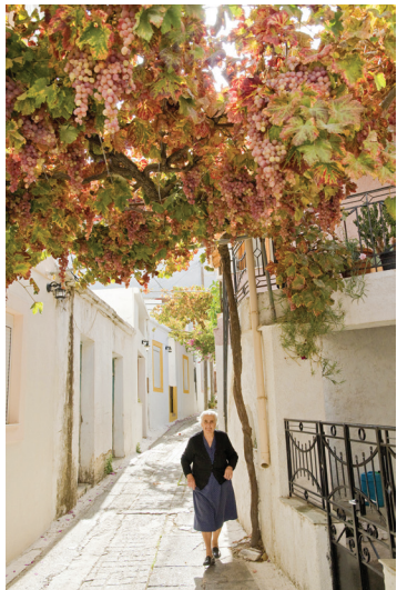
Local village scene

Day 8: Peloponnese/Heraklion, Crete En route to Athens this morning we stop to see the Corinth Canal, cutting at sea level through the narrow Isthmus of Corinth to the Saronic Gulf in the Aegean. We continue on to the Athens airport for the 50-minute flight to Crete, arriving mid-afternoon in Heraklion, the Cretan capital. After checking in at our hotel, we enjoy an afternoon at leisure; this evening we