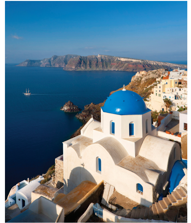
We spend two nights in idyllic Santorini.

Day 14: Depart for U.S. We transfer to Athens' international airport this morning, where we connect with our return flight home. B