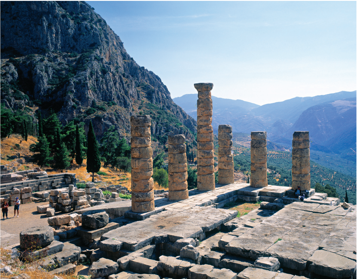
On Day 4, we tour the ruins of Delphi, believed by the ancients to be the “navel [center] of the world.”