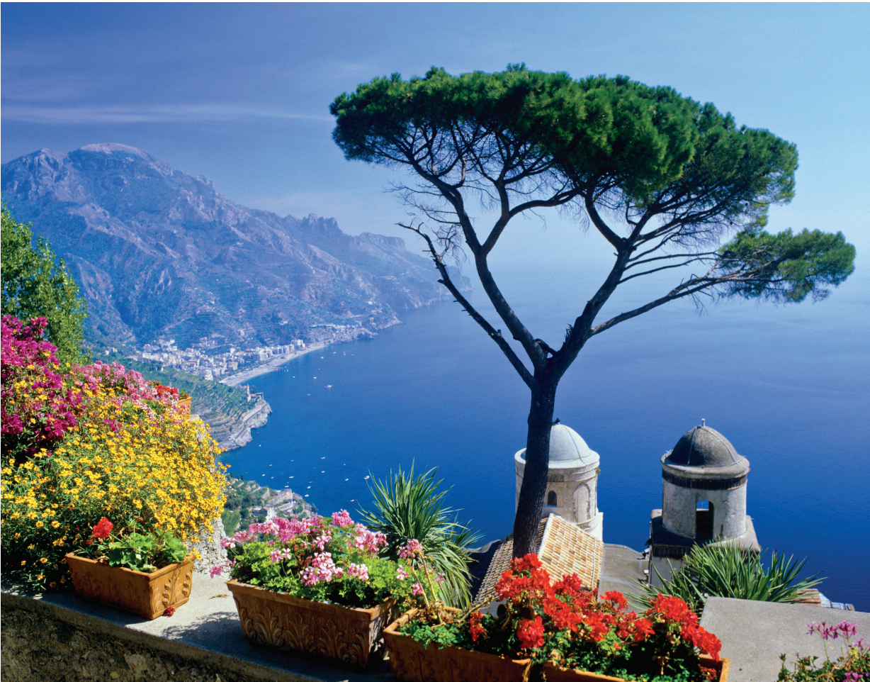
We spend three nights on the stunning Amalfi Coast, with its sheer cliffs, turquoise seas, and classic Mediterranean landscape.

Ratings are based on the Hotel & Travel Index, the travel industry standard reference.