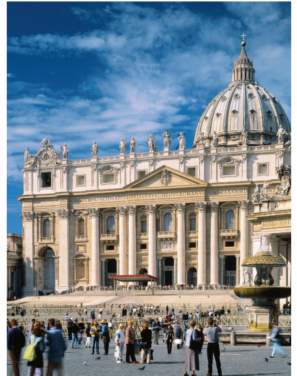
We visit St. Peter's Square and Basilica on Day 7.

Day 15: Venice This morning we take a guided walk through vast St. Mark's Square and surroundings. Our afternoon is free to explore Venice independently; tonight we bid “ arrivederci ” to Italy and our fellow travelers at a farewell dinner. B,D