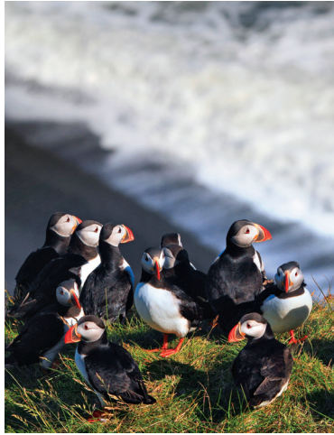
We may see puffins on our tour.

Day 8: Borgarbygggo/Snaefellsnes Peninsula Today we encounter the stunning Snaefellsnes Peninsula. We begin with a walk along the shell sand beach at the abandoned fishing village of Budir, surrounded by a vast lava field. We also explore the caves and bizarre rock formations along the rugged shore at Arnarstapi, site of thousands of nesting cliff birds. After a lunch of a traditional fresh seafood soup at a rustic oceanfront restaurant, we see the haunting remains of abandoned coastal farms at Djupalonssandur. B,L,D