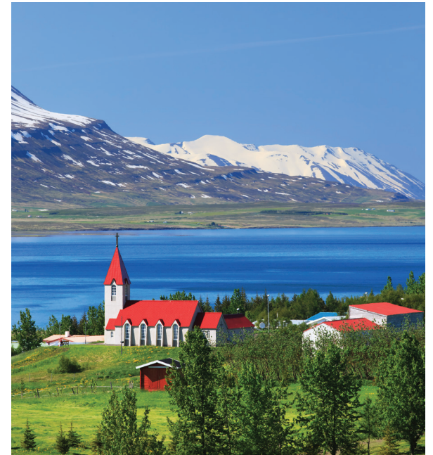
Iceland’s landscape reveals an austere beauty.

tour to the Blue Lagoon. Tonight, we celebrate our adventure over a farewell dinner. B,D