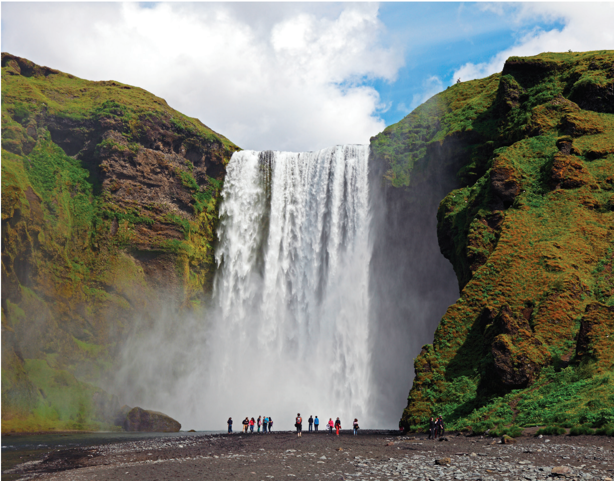
We visit the stunning Skogafoss waterfall, Iceland's largest, on Day 3.