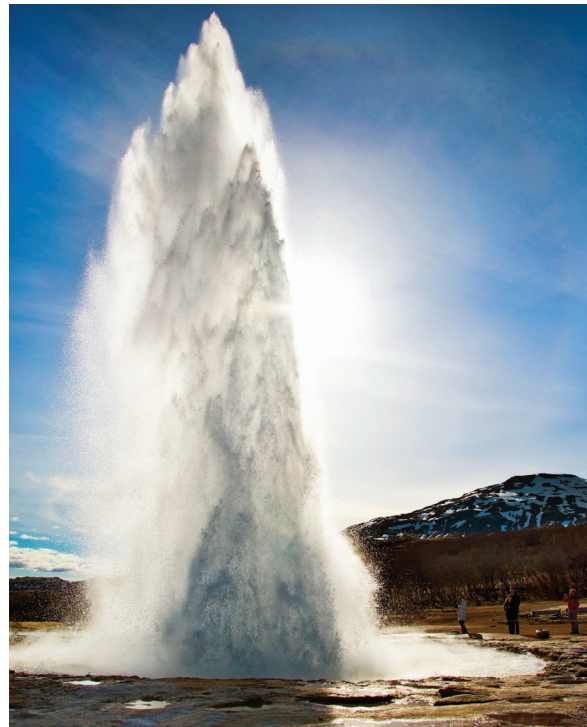
Iceland’s hot spring geysers are famous natural attractions.

Day 10: Reykjavik This morning we embark on a tour of the Icelandic capital. Then the remainder of today is at leisure to explore and enjoy Reykjavik as we please; those who wish can join in an optional