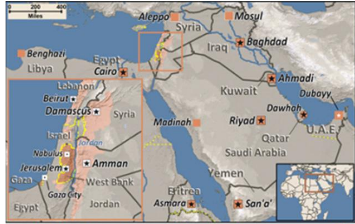
Arab, Palestinian in Gaza/West Bank

People Group Location from IMB. Other Map Data/Geography from GMMS (GMI). Map by Joshua Project