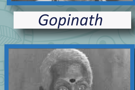
Guru Kunchu Kurup