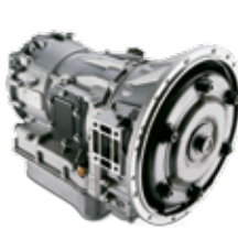
B 210, B 220, B 295

Allison's torque converter smoothly multiplies engine torque, delivering more power to the wheels. By multiplying the engine power, drivers get increased performance, faster acceleration and greater operational flexibility. An Allison Automatic eliminates power interrupts so you can accomplish more, even with a smaller engine.