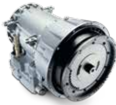
B 300, B 400, B 3400 xFE