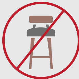
No Bar Seating