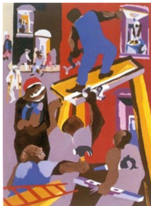
Man on a Scaffold (1985) by Jacob Lawrence UW Professor of Art (1970-1985)