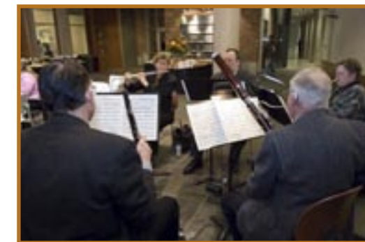
The Ballard Breeze quintet provides music prior to the memorial service.