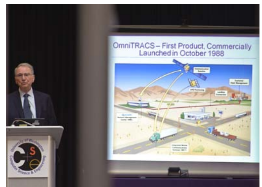
Irwin Jacobs provides an overview of the progression and innovation of wireless technology