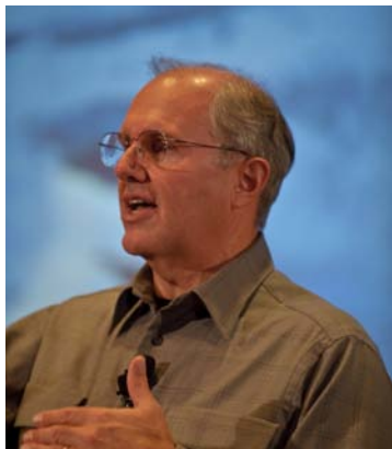
Craig Mundie gives a glimpse of future computer systems

Microsoft chief research and strategy officer Craig Mundie drew a crowd of students, faculty, and alumni to Kane Hall