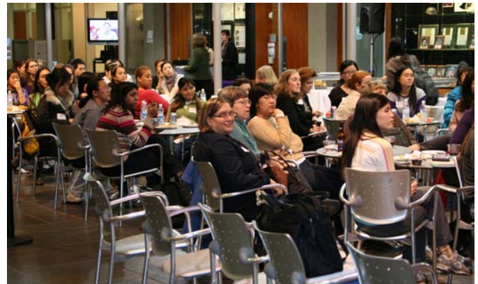
Seattle Girl Geek Dinner attendees enjoy the technical presentations in the Atrium