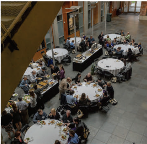
UW CSE Inspirational Teachers Dinner, held May 10th, in the Microsoft Atrium of the Paul G. Allen Center for Computer Science & Engineering.

www.cs.washington.edu/public_files/ugrad/2011_2012teachers.htm