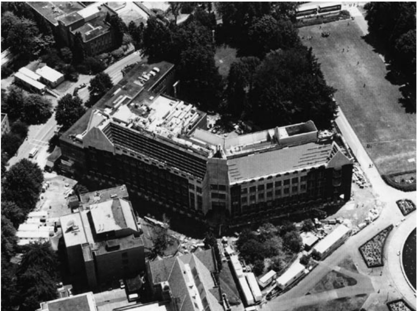
Aerial photo of construction site of EE/CSE Building, June 1996. Find updates at http://www.cs.washington.edu/building/ .