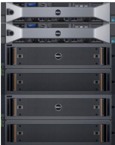
Dell R730 Dell R730 Dell MD1280 84 bay 3.5" LFF 12Gb SAS Dell MD1280 84 bay 3.5" LFF 12Gb SAS

2x QuantaStor Storage Appliances with 1.2PB raw storage (1024TB usable) scalable to over 64PB