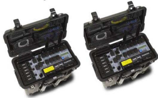
MotionFX Hardware Platform