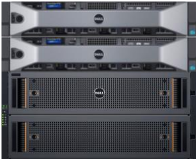
Dell R730 Dell R730 Dell MD1280 84 bay 3.5" LFF 12Gb SAS

2x QuantaStor Mobile Storage Appliances each with 50TB raw storage (40TB usable)