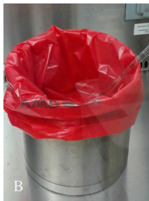
B. BSC Dry Waste Receptacle