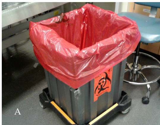
Figure 4.2 A. Grey Bin