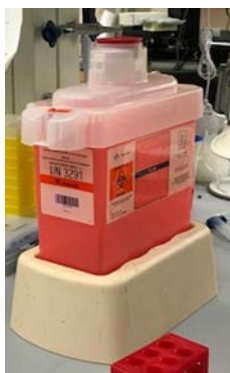
Figure 4.4 Sharps Container

To prevent injury from sharps, place all needles, Pasteur pipettes, syringes, suture needles, scalpels, and razor blades into reusable sharps containers (Figure 4.4). Large volumetric/serological pipettes, or other items that can puncture the biological waste red bags should be disposed of in Sharps containers. Sharps containers must be red, fluorescent orange or orange-red leakproof, rigid, puncture-resistant, shatterproof containers that are marked prominently with the universal biohazard warning symbol and the word “Biohazard” in a contrasting color. Place sharps containers in convenient locations near work areas so they will be used. Do not overfill the sharps containers. Containers should be sealed when they are three-quarters (3/4) full.