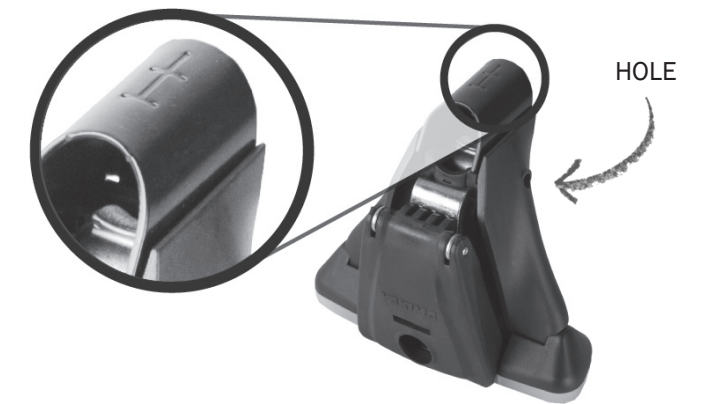
HOLE + HASH MARKS (8000105)