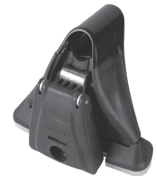
NO HOLE + NO HASH MARKS (8000124/8000135)